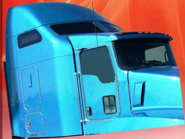
CAB WITH INTEGRATED SLEEPER