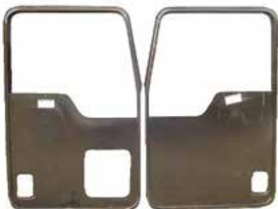
DAY LITE DOORS