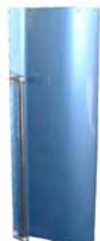
KN01A-L / KN01A-R CAB EXTENSION LOWER ALUMINUM