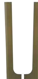
K0160LIE-L K0160LIE-R REAR CORNER PANEL CAB WITH INTEGRAL SLEEPER LH SIDE