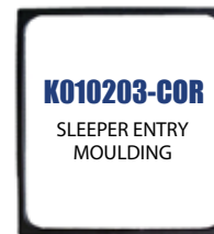
K010203-COR SLEEPER ENTRY MOULDING