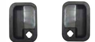
K0103BP-L-H K0103BP-R-H DAY LITE DOOR HANDLE