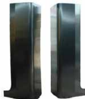
K0103LIE-L K0103LIE-R REAR CORNER PANEL CAB "T"