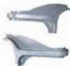
K0103RE-L K0103RE-R "T" CORNER REINFORCEMENT