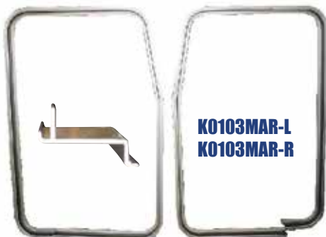
"T" CAB SIDE DOOR JAMS