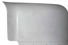
CAB EXTENSION LOWER ALUMINUM