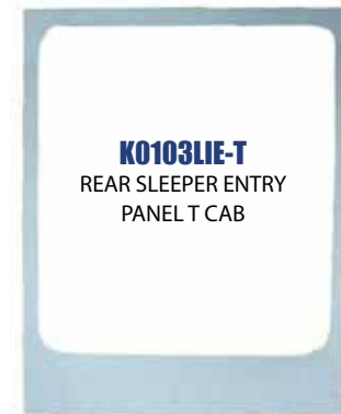
K0103LIE-T REAR SLEEPER ENTRY PANEL T CAB