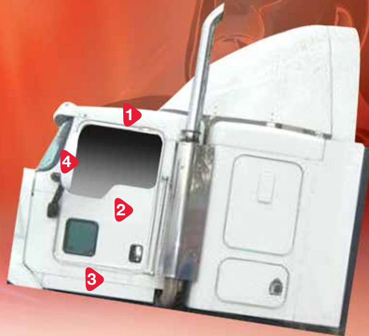
CAB WITH SEPARATE SLEEPER